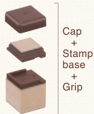
Cap + Stamp base + Grip